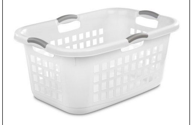
laundry basket or hamper